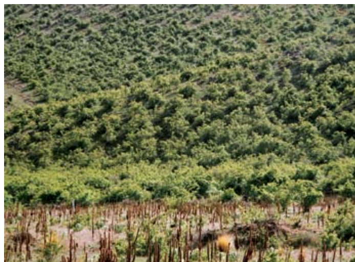
Briar grazed by deer (left) and ungrazed by deer (on right).