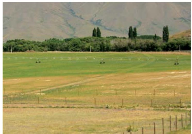
Previously unstocked flats are now highly productive under the new centre pivot.

Briar is a major plant pest for Haldon and it tends to form a thick and impenetrable cover through which sheep will not push. This is a particular problem in the fertile valley floors which tend to retain more moisture and feed through the dry summer. Paddy has found that deer will preferentially forage on the rose berries (hips) and foliage, rendering the seeds unviable and thus halting their spread.