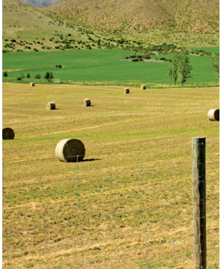
Production of supplementary feed is a major focus on Haldon.

"The biggest risk to sustainability will be staying viable and handling the extremes, be they climatic or market." Paddy Boyd